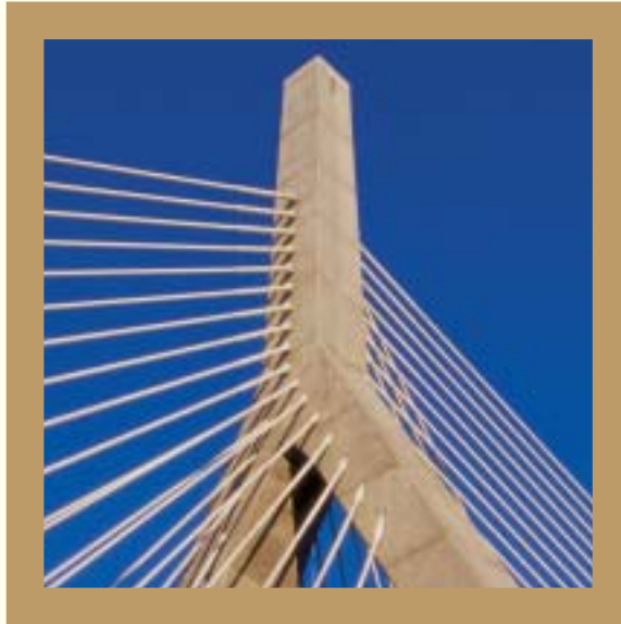
Leonard P. Zakim Bunker Hill Bridge