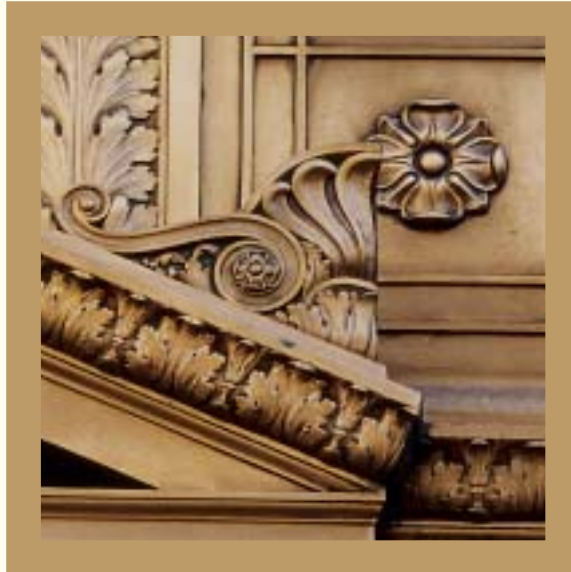
Boston Private Bank & Trust Company